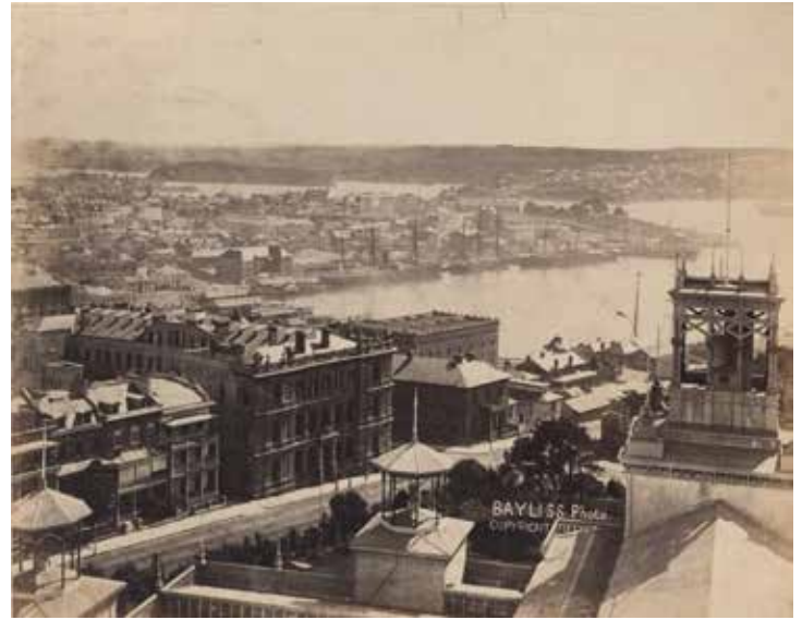
3. [Views Over Sydney From The International Exhibition Building] , c1881. Two albumen paper photographs, one with photographer's line "Bayliss Photo Copyright Regis'td" in negative lower right, 20.7 x 27cm (approx. each). Slight foxing. Framed.

These images were taken from the tower of the Sydney International Exhibition Building (Garden Palace) after construction had been completed. They show a view of Macquarie Street terraces looking across the city to the current Barangaroo, and lower Macquarie Street across Circular Quay to the Rocks.