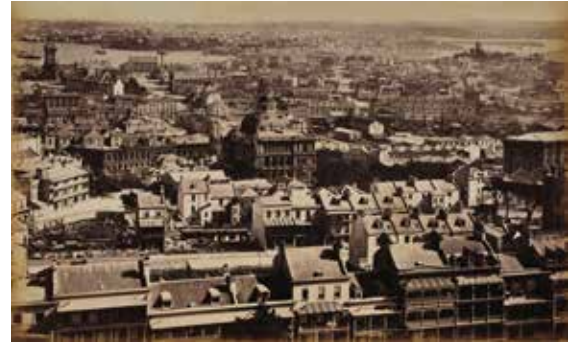
2. [Four Panels From Bayliss' Sydney Panorama From The International Exhibition Building], 1879. Four albumen paper photographs, 34 x 52.4cm (approx. each). Slight foxing or discolouration to edges, one with repaired tear to upper centre of image and edge. Laid down on original backing. Framed.

Charles Bayliss took his 11-panel panorama from the tower of the Sydney International Exhibition Building (Garden Palace) while it was still under construction in either 1878 or 1879 (the building burnt down in 1882). These four panels comprise images 3, 5, 7, and 10 of the panorama, and show the city centre including Town Hall, terraces of Macquarie Street looking across the city to the current Barangaroo, the Sydney Conservatorium including parts of the Exhibition Building in construction, Potts Point and Darling Point. Ref: NLA.