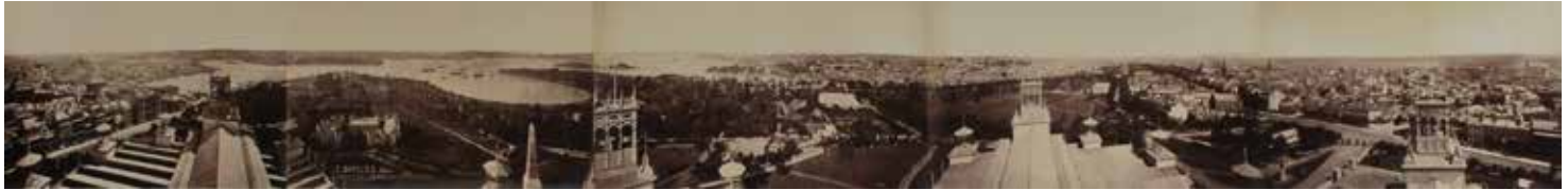
[Circular Quay, Royal Botanic Gardens And View Of Sydney Looking North-East, From The Garden Palace], c1879.