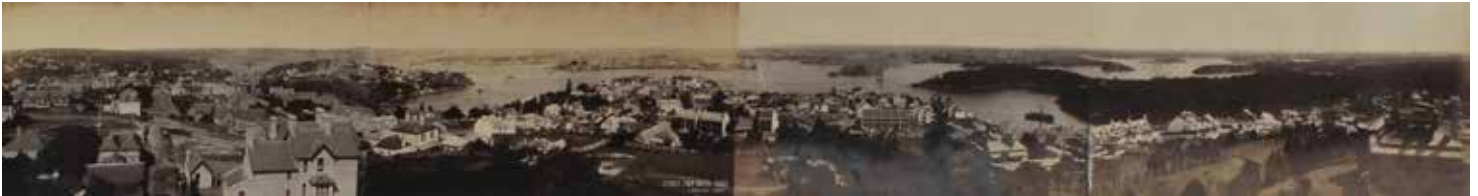
5. Sydney From North Shore , c1885–1889. Albumen paper photograph, four-panel panorama, titled with photographer's line in negative lower centre of one panel, 14 x 111.6cm. Slight foxing. Linen-backed, framed.

These images were taken from the dome of the Sydney International Exhibition Building (Garden Palace) which opened in 1879 and burned down in 1882. The Exhibition Building stood in the grounds of the Royal Botanic Gardens, Sydney.