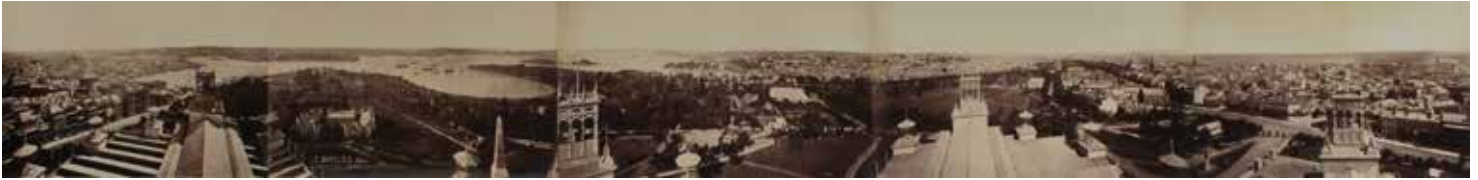
4. [Circular Quay, Royal Botanic Gardens And View Of Sydney Looking North-East From The Garden Palace] , 1880–1881. Albumen paper photograph, five-panel panorama, photographer's line in negative lower left of one panel, 14.3 x 129.7cm. Linen-backed, framed.

These images were taken from the dome of the Sydney International Exhibition Building (Garden Palace) which opened in 1879 and burned down in 1882. The Exhibition Building stood in the grounds of the Royal Botanic Gardens, Sydney.