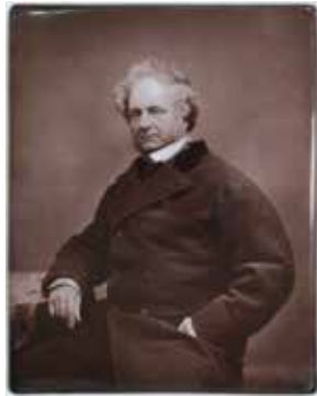
53. J. Corne [?], 1881. Photographic transfer on ceramic tile, partly obscured title and dated "May 1881" in ink verso, 22.7 x 18cm.

Erroneously titled "Torrens Lake." Similar image held in State Library of SA with text "...The buildings visible in the background are possibly at Hindmarsh..."