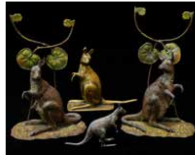
78. Four Kangaroo Figurines , c1900-1920s. Brass, pewter, and tin figurines, "Made in Australia" stamp impressed into brass kangaroo base, sizes range from 5.5 x 8 x 1.8cm to 16 x 11 x 6cm. Slight rust and paint loss to pewter and tin kangaroos, one tin kangaroo with missing ear and loose card holder

Images include Waitemata Harbour with shipping vessels; local businesses along the Hobson Street Wharf, including "Seagar Bros, Boiler Makers"; a rowing event, showing 24 Maori men on Waka tiwai (recreational canoes still raced in regattas today); waka peke (leaping canoes), shown jumping over logs raised slightly above the water surface; views of local businesses on Queen Street, including "P&A Photographic Supply Store" and "Court Bros. Drapery"; views of the Botanic Gardens, streams and river ways, as well as a site of deforestation; and topographical views over the city of Auckland. Ref: TeAra Encyclopedia of NZ; National Library of NZ.