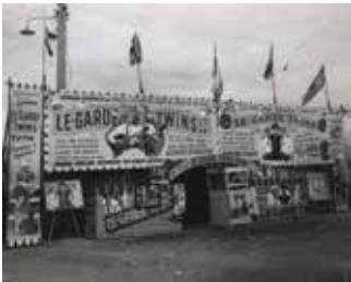
154. Reg V. Brock (Australian, b.1914). Le-Garde Twins, Your Own Australian Cowboy Ambassadors , c1954. Vintage silver gelatin photograph, photographer's label attached verso, 19.3 x 24.5cm. Slight stains to image upper right, minor handling creases, scuffing.