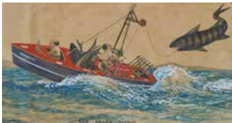
116. The Shark Patrol , c1920s. Watercolour with gouache, titled in ink on image lower centre, 28 x 53.5cm. Cockling. Framed. $660

117. Hugh McCrae (Aust., 1876-1958). Wine Is A Villain, Make No Doubt [ Temperance Poem ], c1920s. Ink and wash, signed lower left, "H. Fleming" framing label attached to backing verso, 23.4 x 15.7cm. Slight foxing, minor missing portions or tears to edges, old mount burn, laid down on original glue-stained backing.