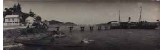
77. New Zealand "Panorams" [Auckland] , c1900. Forty-two (42) print-out paper photographs, panorama format, in a re-bound oblong cloth folio with original title label, 8.5 x 29.3cm (approx. each). Slight foxing to album pages not affecting images, each laid down on an album page.