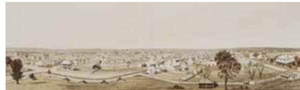
57. Panoramic View Of Liverpool Shewing [Sic] Moorbank Estate Photographed From Church Tower [NSW] , c1888. Tinted lithograph, text including title above and below image, 18.2 x 54cm. Old fold as issued, repaired minor perforations or tears and minor foxing to margins. Laid down on acid-free tissue.

Scenes include indigenous people from the Pacific region, including one item with finely detailed carvings showing people amongst thatched huts, palm trees, and a border of faces. A detailed list is available upon request.