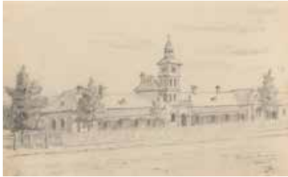
74. Railway Station, Albury [NSW] , c1900. Pencil drawing, titled and initialled "W'm P." lower right, 11.5 x 18cm. Minor foxing to right and lower edges.