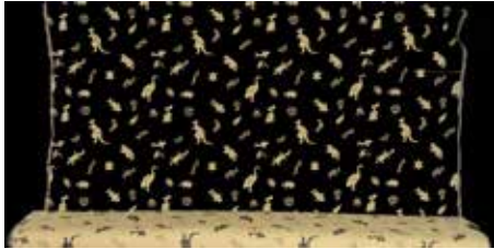
152. Australia Upholstery Fabric , c1950s. Jacquard weave in cotton, 780 x 120cm.