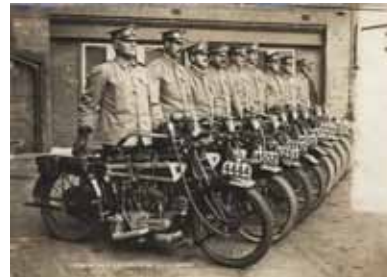
98. Some Of The NSW Police On AJS Motors , c1915. Silver gelatin photograph, titled in negative lower left, photographer's blind stamp on image lower right, annotated in ink verso, 14.7 x 20.5cm. Creases and scuffs overall, slight tears and minor surface loss to edges of image.