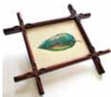
109. Bush Scene With Huts, Horse and Kangaroo , c1920s. Oil on eucalyptus leaf, 8.6 x 21.8cm. Perforations to leaf prior to painting. In original frame.