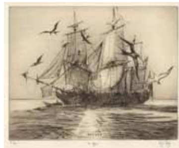
Image depicts Flinders' Investigator meeting Baudin's Le Geographe in Encounter Bay, South Australia on 7 April 1802.

130. Geoffrey C. Ingleton (Aust., 1908-1998). Sea Ruffians , c1930s. Etching, captioned " Bounty " in plate lower centre, editioned 16/50, titled and signed in ink in lower margin, 22.8 x 29cm.