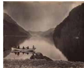
60. Burton Bros. (NZ, 1866-1914). [Milford Sound, New Zealand] , c1890s. Collection of 23 printout paper photographs, most captioned in pencil on backing verso, 24 x 29.1cm (approx. each). Some with scuffs to surface or minor retouching, all slightly discoloured to edges and some more extensively, all laid down on original backing.