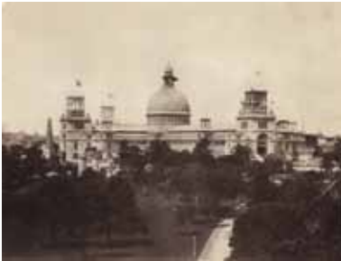
39. [ Garden Palace, Sydney, Before And After Its Destruction By Fire ], c1879-1882. Group of seven albumen paper photographs, some captioned in negative, some annotated in pencil verso or on old backing, three with photographer's stamp verso, sizes from 10.2 x 18.6cm to 26.3 x 35.4cm. Slight stains, creases, repaired tears to some images.