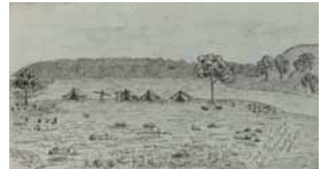
37. F. J. Mallett. Pair of drawings:

(a) Camp At The "Springs", South Purrumbete [Hepburn Springs, Victoria] , 1877. Pen and ink, titled, signed and dated "Nov. 1877" lower right, 10.2 x 19.9cm (paper). Minor stains to upper portion, laid down on original album page.