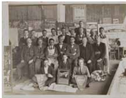
112. H. Rousel, Signwriter Company Portrait , 1921. Silver gelatin photograph, signed "Vera White" in pencil on backing below image, stamp with date "June 1921" and annotation in ink on backing verso, 14 x 19.1cm. Slight paper loss to margins, laid down on original backing. Framed.

Captions for the first and last panels read "January 1st. Jones: 'From now on - come what may - I shall spend every Saturday keeping my garden in order.'" The panels between these show the same character watching cricket, football and horse races for most of the months of the year.