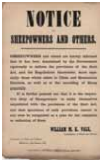
34. Notice To Sheep-owners [Sic] And Others , 1872. Letterpress, handbill, 30.4 x 18.3cm. Slight offsetting from a previous hand-written document, foxing overall, stains and minor tears to edges.