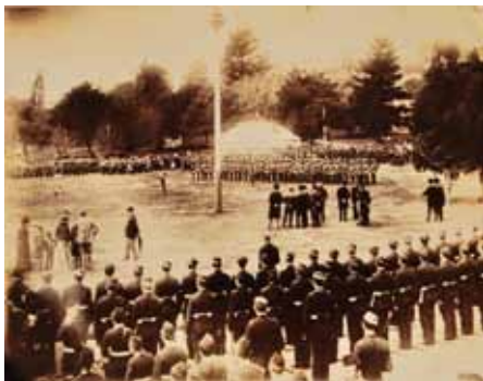
80. The First Tasmanian Contingent [Boer War] , c1899. Printout paper photograph, letterpress caption on label affixed to backing below image, 15.3 x 20.2cm. Surface loss to upper right corner and left edge, tear lower left, slight discolouration overall, laid down on original backing. Original frame.