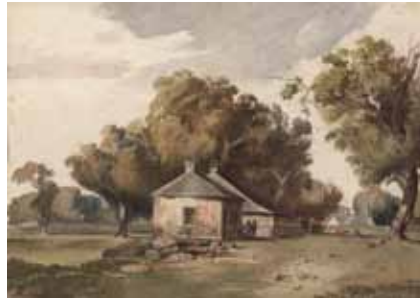
30. Attrib. Louis Buvelot (Swiss/Aust., 1814-1888). Old Houses In Richmond Paddock , c1870s. Watercolour, annotated in an unknown hand in pencil on backing below image, annotation is repeated in another hand on backing verso, 20.5 x 29.1cm. Foxing overall, laid down on old backing.