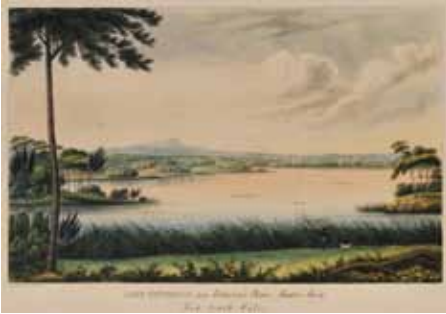
6. Joseph Lycett (Aust., c1775-c1828). Lake Patterson, Near Patterson's Plains, Hunters River, New South Wales , 1824. Hand-coloured aquatint with etching, text with artist, title and date in plate below image, 17.3 x 27.3cm. Minor foxing, slight creases to margins. Framed. $1,250 Text includes "J. Lycett del et execut'r. London, published Sept'r 1st, 1824, by J. Souter, 73 St Paul's Church Yard."