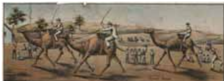
58. Gold Mining And Architecture, Coolgardie, Western Australia , c1890s. Collection of 20 colour lithographs, most captioned in image, sizes range from 5 x 12.5cm to 10.1 x 27.3cm. Most with repaired tears,

creases, missing portions or old folds, stains and soiling overall. All laid down on acid-free backing.