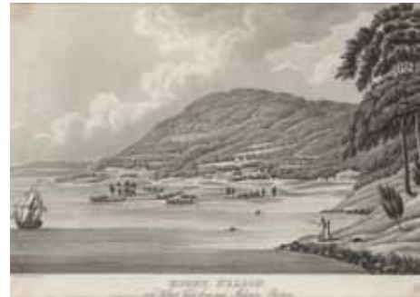
7. Joseph Lycett (Australian, c1775-c1828). Mount Nelson Near Hobart Town From Near Mulgrave Battery , 1825. Etching and aquatint, signed and titled in plate below image, 17.4 x 27.9cm. Trimmed margins including some text, minor stains to image, missing portion to lower right corner below image. Remargined. $990 Illustrated in McPhee (ed.), Joseph Lycett: Convict Artist , 2006, p229, plate 113. Held in National Gallery of Australia collection.