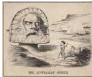
35. "Sydney Punch" , 1873. Collection of 12 periodicals bound together, illustrated with over 260 line-blocks, wood engravings and lithographs, from Jan. to Dec. 1873, Tyrrells' stamp on front endpaper, 27.1 x 22.2cm (quarto). Foxing, stains, tears, missing portions to some pages.