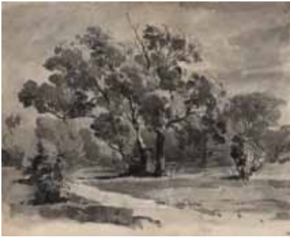
28. Louis Buvelot (Swiss/Australian, 1814-1888). [ Rural Landscape ], 1870. Ink and wash with pencil, initialed in ink lower left, dated in pencil lower right, 25.6 x 33.1cm. Old repairs and crinkles overall, missing portions and tears to edges of image, surface loss verso.