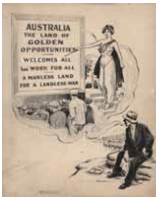
110. Frank Campbell (Australian, d.1966). Memories , c1920s. Pen and ink with white gouache, signed lower right, annotated and titled in pencil below image, 34.8 x 28.2cm. Slight foxing overall, old fold, creases and tears to edges, slip of paper attached to caption.