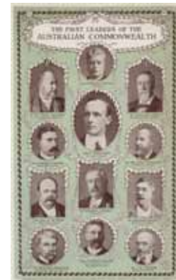
82. The First Leaders Of The Australian Commonwealth , c1901. Colour process screen and letterpress, title with captions and text throughout image, 21.2 x 13cm. Minor soiling and tears to margins.

Text continues "Portrait presented by the Duke of Portland to the Victoria Racing Club, 1896."