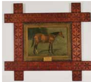
81. Carbine , c1900. Colour process screen, text including title and artist's name "Frederic Shelton" in block lower centre, 30.5 x 38.2cm (image), 61.9 x 68.4cm. Minor scuffs to image. In hand-carved frame.

Caption continues "Which left for the Transvaal on the 27th day of October, 1899, to take part in the War between Great Britain and the Boers."