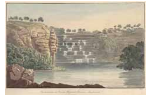
8. Charles Hamilton Smith (Brit., 1776-1859). After Phillip Parker King (Aust., 1791-1856). The Cascade In Prince Regent River, Australia [The Kimberley, WA] , c1830. Watercolour with pencil, initialled "C.H.S." and titled in ink in lower margin, 17.9 x 29.1cm. Minor foxing overall.

It is extremely rare to find a Lycett watercolour of this size and nature in private hands. Comparable works are held in the Mitchell Library and NLA collections.