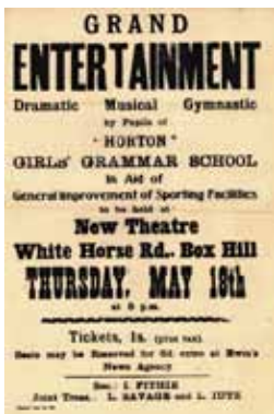
116. Grand Entertainment, Dramatic, Musical, Gymnastic, By Pupils Of "Horton" Girls' Grammar School , c1922. Letterpress, handbill, 41.6 x 25.4cm. Old folds, creases and foxing overall.