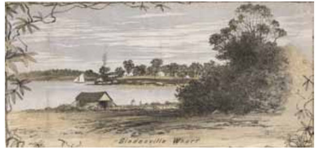
41. Gladesville Wharf [NSW] , c1880s. Colour lithograph, titled in image lower centre, 10.9 x 22.6cm. Slight stains and foxing overall, trimmed to edges of image.