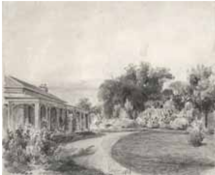
33. Attrib. Louis Buvelot (Swiss/Aust., 1814-1888). Lilydale, [Homestead In Victoria] , 1871. Pencil drawing, titled and dated lower centre, annotated in another hand in pencil verso, 26.5 x 33.3cm (paper). Minor foxing, soiling and crinkles, pinholes to edges. $3,300