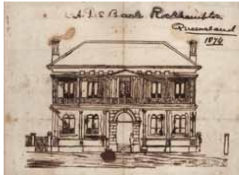
36. AJS [Australian Joint Stock] Bank, Rockhampton, Queensland , 1874. Pen and ink, titled and dated above image, 15.5 x 20.9cm. Old folds, stains and foxing overall. Laid down on acid-free backing.