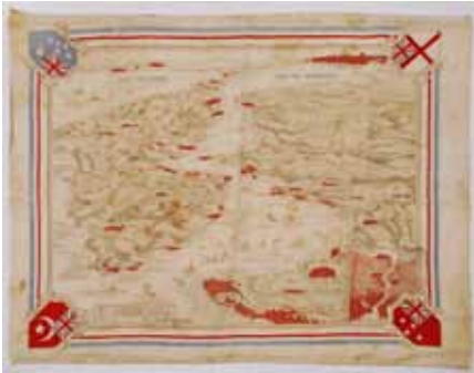
94. Map Of Gallipoli And The Dardanelles , c1914. Printed cotton scarf, captioned throughout, 47.5 x 61.5cm. Stains and foxing overall.