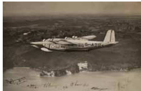
122. Empire Flying Boat "Centaurus." England-Australia-New Zealand Survey Flight , c1937-1938. Silver gelatin photograph, autographed by crew in ink on image lower left to right, titled in ink on accompanying slips mounted above and below image, 29.1 x 38cm. Slight scuffs, dents and minor foxing to image, surface loss and paper remnants to margins.