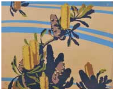
124. E.A. Jones . [ Banksia Wallpaper Design ], 1939. Pair of colour screenprints on card, each monogrammed in image lower left, signed and dated in ink on image lower centre, 69.4 x 89.6cm (approx. each). Stains, soiling and foxing overall, tears, creases, chips and surface loss to edges of image, cracks and missing portions to margins.

J.V. Broughton, F/E; A. Lowe, S/W/O; [H?] Dangerfield, [?]; [?] Bingham." The Centaurus G-ADUT, an Imperial Airways flying boat, was acquired by the RAAF in September 1939 (and renamed A18-10), as it was in Australia at the time. It was destroyed by enemy action on 3 rd March 1942, on Broome Harbour, piloted by Captain Keith Caldwell. Imperial Airways received, as a swap in place of Centaurus , the Qantas Empire Airways flying boat Corio VH-ABD (renamed G-AEUH). Ref: ADF-serials.com.