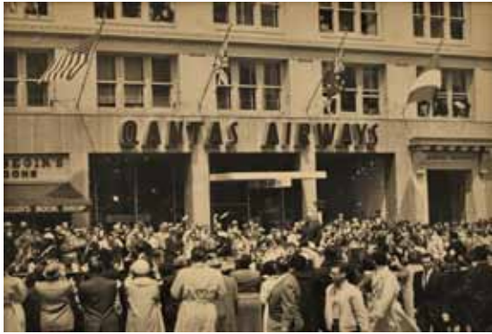
135. Captain Robert A. Gray. [ General de Gaulle In San Francisco ], 1960. Silver gelatin photograph, titled, dated "March 1960", annotated and signed in ink on slip mounted below image, 39 x 49.8cm. Slight foxing overall, minor creases and stains to margins.