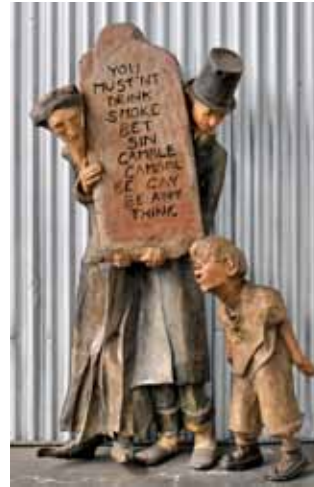
138. After Norman Lindsay (Aust., 1879-1969). [ The Wowsers ], 1987. Two fibreglass sculptures with polyethylene pipe, wood, cloth and papier maché, 197 x 92 x 44cm (approx. large figures); 104 x 48 x 44cm (small figure). Some cracking to feet, one foot loose, buckling to wood, soiling.