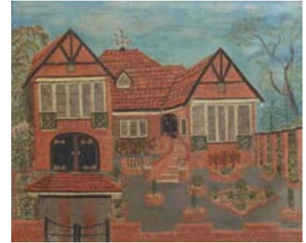
51. Anon. Tudor House, Surfers [Paradise] , c1940s. Oil on board, titled and initialed "C.F." lower right, 44.1 x 54.6cm. Few drops of white paint across image. In original frame.