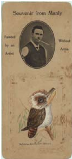
38. W. Smith (Aus.). Souvenir From Manly , c1920. Process print and watercolour on embossed presentation card, titled, annotated and signed in ink with text, 20.4 x 9.7cm (card). Foxing, surface soiling, slight creases.

Caption continues "A local identity in Dubbo in 1920s (Market Gardener)."