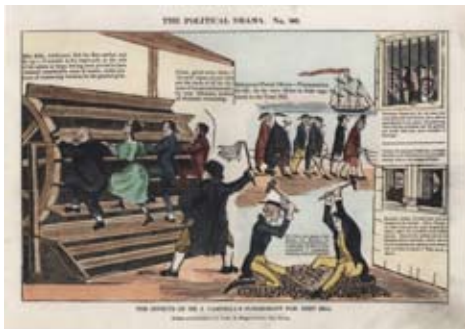
4. [Transportation] Anon. The Effects Of Sir J. Campbell's Punishment For Debt Bill , c1830s. Hand-coloured woodcut, captions and text in letterpress on image and upper and lower margins, 21.4 x 34.7cm. Tears, slight missing portions and perforations to margins, soiling to lower right corner, crinkles overall.