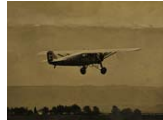
42. Frank Hurley (Australian, 1885-1962). The Spirit Of Australia At Richmond , c1928. Silver gelatin photograph, captioned, photographer and publishing annotations in pencil and ink in various hands verso, 17.9 x 24.1cm. Old fold with cracking to upper portion, slight stains to centre of image, handling crinkles overall.

Depicts Central Railway Station in Sydney, viewed from the northern side.