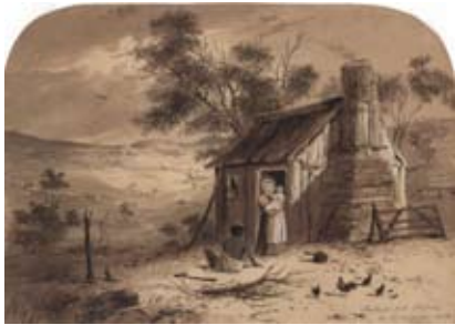
9. S.T. Gill (Brit./Aus., 1818-1880). [ Collection Of Drawings Depicting An Australian Homestead, And Landscapes ], 1842. Five watercolours with ink and wash, some with added white highlight, all initialled in ink "S.T.G." and titled in ink or pencil lower left to right, one image (e) dated "1842" with illegible annotation in pencil verso, sizes range from 12.6 x 20.3cm to 17 x 23.4cm. Minor foxing to all, (a) old crease to upper edge of image, (e) repaired tear to upper edge of image.