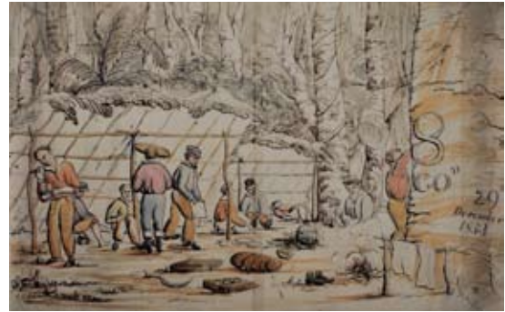
10. Anon. [ Men At Camp Site ], 1853. Iron gall ink and watercolour on two joined sheets of paper, dated and annotated centre right, 66 x 104.6cm. Some paper loss due to oxidation caused by iron content in ink, chips and discolouration to edges, foxing overall.