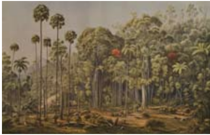
15. Eugene von Guerard (Australian, 1811-1901). Cabbage Tree Forest, American Creek (NSW) , 1867. Colour lithograph with added hand-colouring, signed in image lower left, title with blind stamp in lower margin, plate number "XV" with letterpress text on accompanying page,

36.5 x 52.7cm. Slight foxing and stains to margins.