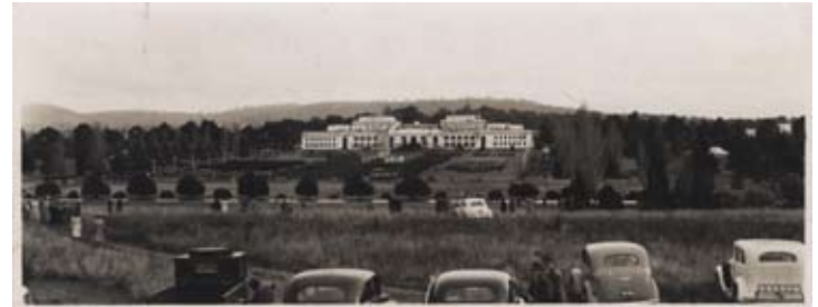
52. Unveiling Of King George VI Statue, Canberra, 1951. Silver gelatin photograph, captioned in ink in two hands, photographer's copyright stamp (faint) with date and negative number "15-18" in ink verso, 16.6 x 42.1cm. Cracking to upper right corner, slight crinkles, dents and soiling overall.