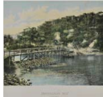
26. Phillip-Stephan (Australian, active 1884-1910). Mossmans [Sic] Bay, Sydney, c1890s. Colour photo-lithograph, text and title in lower margin, 32.8 x 35cm. Repaired tears and creases to upper edge of image and to margins, stains overall.

Text reads "Phillip-Stephan Photo-Litho & Typographic Process Company Limited, Sydney, NSW."