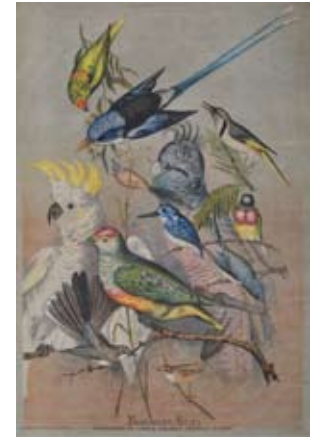
57. Ellis Rowan (Aus., 1848-1922). Australian Birds , c1890. Colour lithograph, signed in image lower right, title and text in image lower centre, 57.8 x 39.6cm. Repaired slight tears and missing portions to edges of image, old folds with cracking. Laid down on acid-free paper.

The text was mistakenly printed the wrong way without noting the correct orientation of the flowers.