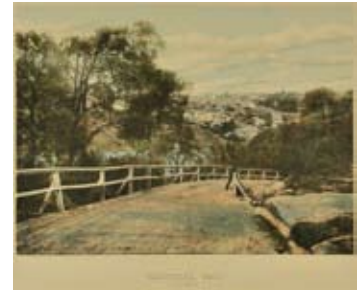
27. Phillip-Stephan (Australian, active 1884-1910). Neutral Bay, Sydney, c1890s. Colour photo-lithograph, text and title in lower margin, 33.7 x 35.8cm. Repaired tears, creases and missing portions to margins not affecting image.

Text reads "Phillip-Stephan Photo-Litho & Typographic Process Company Limited, Sydney, NSW."