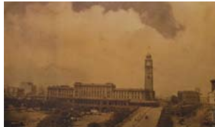
40. Anon. [ Central Station, Sydney ], c1920s. Silver gelatin photograph, 57.1 x 100.5cm. Repaired tears and creases, slight stains overall. In original frame.

Annotation reads "Armless artist." Text reads "Painted by an artist without arms."