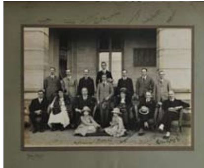
39. Anon. [ HRH Edward, Prince Of Wales And Sir Walter Davidson, Governor of NSW With Other Dignitaries At Government House ], c1920. Silver gelatin photograph, autographed in ink by 13 of the 16 sitters on lower portion of image and on mount above and below image, inscription in ink in an unknown hand on mount verso, 26.6 x 37.6cm. Slight discolouration and silvering to edges. Laid down on original backing.

Variant image, which is included in an aviation collection in this catalogue (#105), is accompanied with typed caption "Hammond's first flight at Ascot Race Course, Sydney, in the early dawn, 29 th April, 1911."