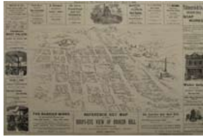
22. Anon. Bird's Eye View Of Broken Hill Reference Key Map, 1889. Lithograph with wood engraving, and letterpress text, some vignettes initialled "A.S." or signed "Scott Broad" and dated in block, captions throughout image, text with date above and below image, 58.6 x 86.6cm. Old folds as issued, repaired slight missing portions,

Text includes "Part northern elevation, and section through tower. The Building and Engineering Journal , Dec. 14, 1889."