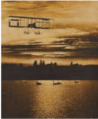
37. Anon. ( Hammond's First Flight At Ascot Race Course, Sydney... ), 1911. Silver gelatin photograph, 31.4 x 25.8cm. Silvering and creases overall, repaired tears to corner of image, chips to edges.