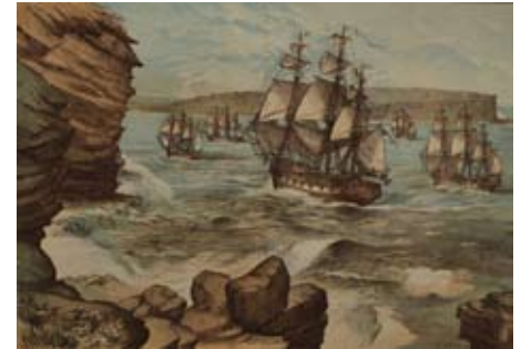
20. After E. Le Bihan . The First Fleet Entering Port Jackson , 1888. Colour lithograph with wood engraving, artist and date in image lower right, text and title above and below image, 46 x 61.1cm. Old folds as issued, minor stains and foxing, repaired tears and missing portions to margins. Laid down on acid-free paper.