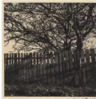
7. [Fence And Tree] , 1937. Vintage silver gelatin photograph, signed and dated in ink in lower margin, 15 x 14.9cm.