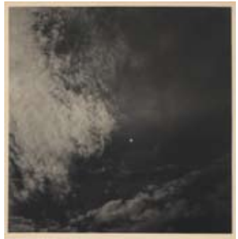
9. Sky Submerged , c1937. Vintage silver gelatin photograph, 24.8 x 24cm. Slight crease to upper left corner of margin, minor stains and foxing to lower margin.

Illustrated in Ennis' two books: Olive Cotton, Photographer , NLA, 1995, p69, and Olive Cotton , AGNSW, 2000, p17. Held in the National Gallery of Australia and National Library of Australia collections.