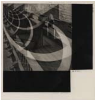
16. [Montage With Curves] , c1940. Vintage silver gelatin photograph, 13.7 x 13.6cm. Slight crazing and scuffing to image, vertical crease with cracking to periphery of image.