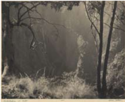
6. Orchestration In Light , 1937. Vintage silver gelatin photograph, titled and signed in green ink and dated in pencil in lower margin, annotated and titled with address in ink verso, 28.1 x 35.9cm. Stain to lower edge of image, retouching to image upper centre and lower left and right, slight surface loss to left margin.