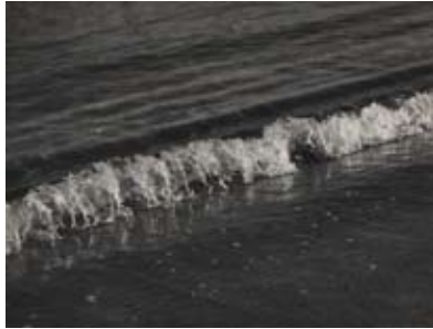
5. [Small Wave Breaking] , c1935. Vintage silver gelatin photograph, 15.5 x 20.3cm. Small indentations overall, minor chips to edges of upper margin.