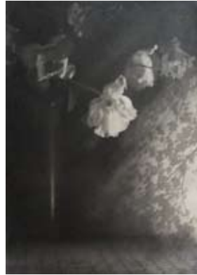
13. [Windflower Montage With Shadow Pattern] , 1939. Vintage silver gelatin photograph, 37.6 x 30.2cm. Minor indentation to image upper centre, slight foxing to image lower right and margins, stain to lower left corner of margin.