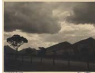
8. Currabubulla [sic] , c1937. Vintage silver gelatin photograph, titled and signed in ink in lower margin, 15 x 19.8cm. Minor crinkle to upper centre of image.