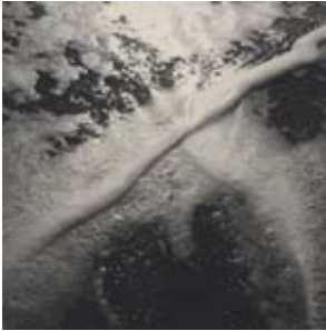
4. [Sea Foam] , c1935. Vintage silver gelatin photograph, signed in pencil verso, 25.1 x 24.3cm. Minor indentations to image lower centre, pinhole to lower left corner of margin, slight wear, foxing and stain to margins.