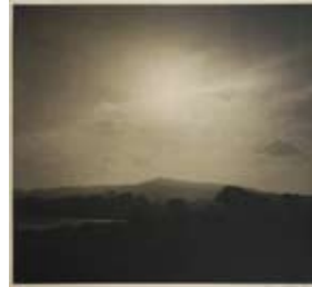
14. Light Over The Mountain , 1940. Vintage silver gelatin photograph, signed and dated in pencil in lower margin, titled and dated in ink verso, 29.4 x 32cm. Minor retouching to image overall, slight scuffs to lower right of image, paper remnants verso.

The more commonly known variant of Windflowers is illustrated in Ennis' two books: Olive Cotton, Photographer , NLA, 1995, p63, and Olive Cotton , AGNSW, 2000, p51.