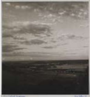
11. New England Landscape , 1938. Vintage silver gelatin photograph, titled, signed and dated in ink in lower margin, 30.7 x 29.9cm. Small indentations to image upper right, slight foxing to lower margin, minor wear to corners of margins.