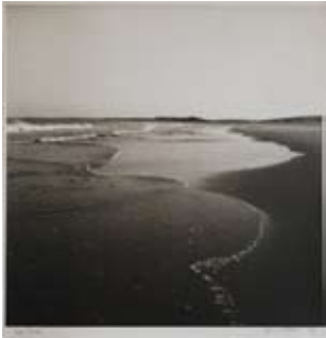
10. Low Tide , 1938. Vintage silver gelatin photograph, titled, signed and dated in pencil in lower margin, 30.7 x 30.1cm. Minor foxing to image upper left and right and to left margin, slight crease to upper left corner of image and lower left corner of margin.