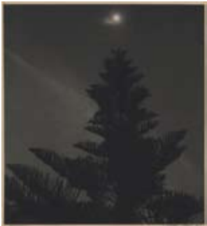
12. Nocturne , 1938. Vintage silver gelatin photograph, signed in pencil on image lower right, titled, signed and dated in pencil in lower margin, signed and titled with cancelled title "Soaring" in ink by Cotton, and numeric annotations in ink and crayon in an unknown hand verso, 24.1 x 21.9cm. Minor scuffs and indentations overall, slight retouching to image upper right, small stains to lower edge of image and to upper margin. Laid down on original backing.

Taken on a camping field trip with Cotton's geologist father. (Ref. Sally McInerney)