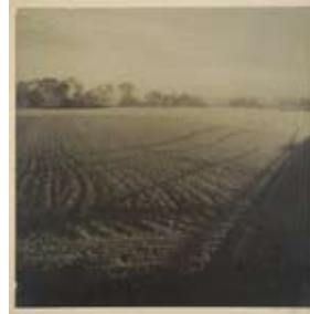
15. [Ploughed Field With Shadows] , 1940. Vintage silver gelatin photograph, signed and dated in pencil in lower margin, 29.6 x 29.5cm. Minor rubbing to image upper and left centre, slight paper loss to edges of image. Laid down on original backing.